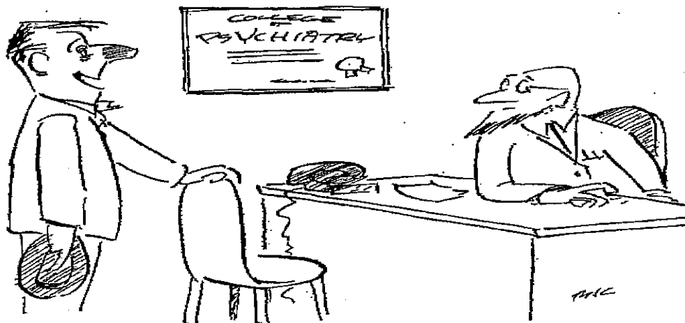
"I'm sorry your hypnotic suggestions didn't stop my drinking — maybe you can make my wife believe it's a pleasure living with a drunk."