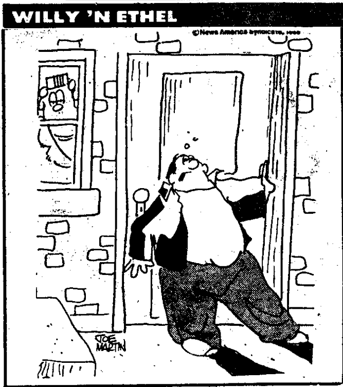
"Oh...and I suppose you'd rather I came home thirsty?"

A wife was angrily complaining that they were getting deeper and deeper into debt. "I can't understand it," her spouse calmly replied. "I earn $500 a month, you make $250, and we get about $100 a month refund on beer bottles."