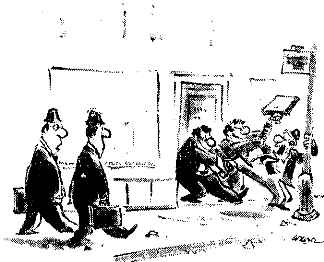
"AA, they say, is a program of attraction."