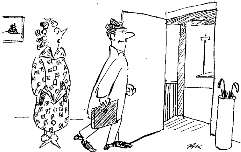
"'Easy Does It,' 'First Things First,' 'Let Go and Let God,' and 'Think.'"