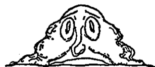
Self-Pity (Found in the lowlands near Self, Australia)