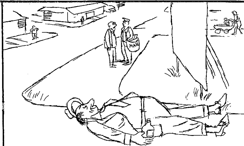
"He says he'd try AA but he's afraid his neighbors will find out he's a drunk."