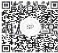
Venmo QR code