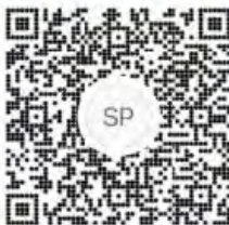
Código QR Venmo