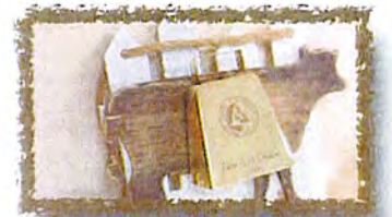
THE COVETED W.I.S.A. COW BELL!

DEADLINE FOR ENTRIES: FRIDAY OCTOBER 1ST