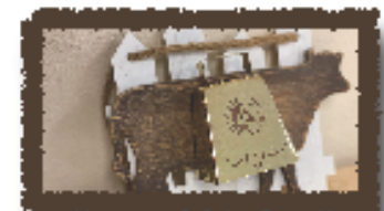
THE COVETED W.I.S.A COW BELL!

DEADLINE FOR ENTRIES: FRIDAY OCTOBER 1ST