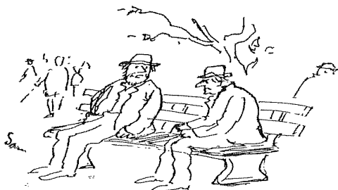
"Just because the bars close on Election Day is no reason to favor dictatorship."