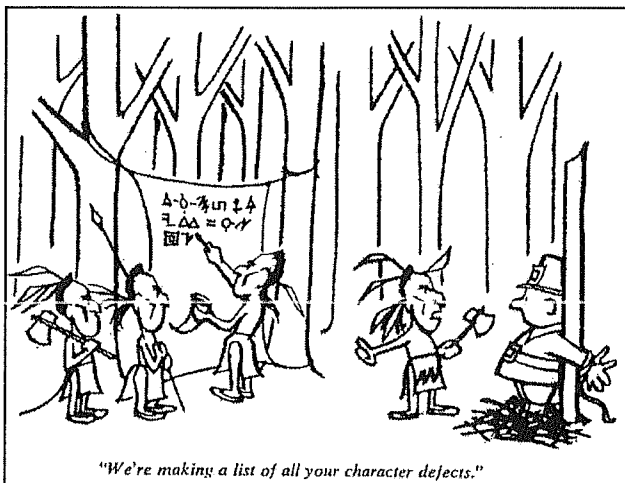
"We're making a list of all your character defects."