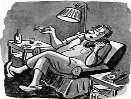
"No, I've never tried AA, but if it's got alcohol in it I think I'd like it."