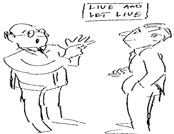
"Twelfth Step work requires tolerance, persistence, understanding, and resisting the urge to take the phone off the hook when going to bed!"