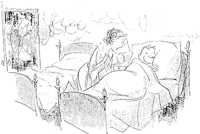
"I know you don't want anything to upset your serenity, dear, but the house is on fire!"

HELP NEEDED: Looking for experienced bookkeepers/accountants to help with an audit at CSO. The chairperson has already been selected, but she will need help. Please call 821-6325 if you are interested in helping with this service.