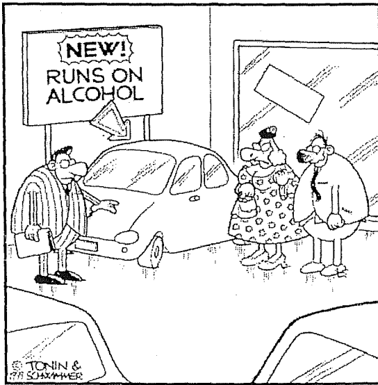
"WHAT A COINCIDENCE - SO DOES HE."