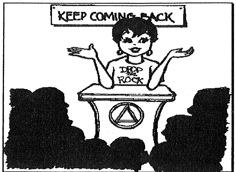
My sponsor says that sitting in a bar and asking myself not to drink is like sneaking sunup past a rooster. -The Grapevine