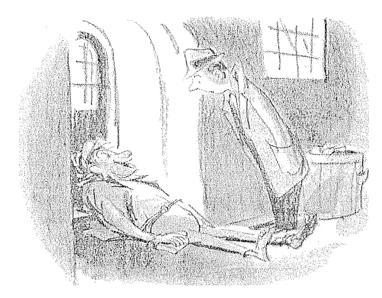
"I'm not powerless over alcohol. I just can't get up."

with permission from the Grapevine, June 1967