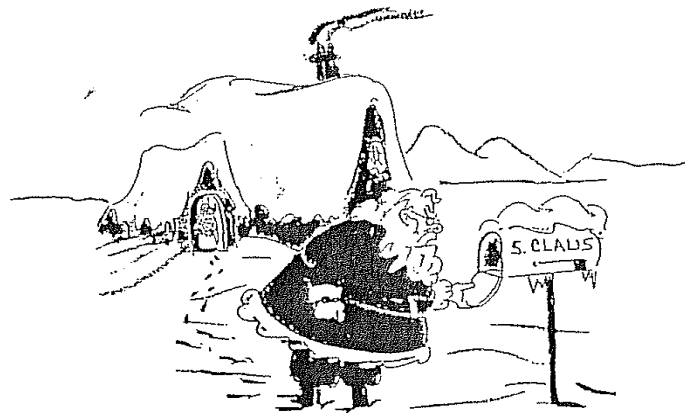
Not one crummy Valentine!