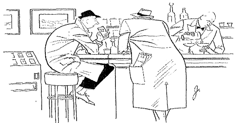
“I ought to go to an AA meeting tonight, but I can’t—my wife’s sick.”