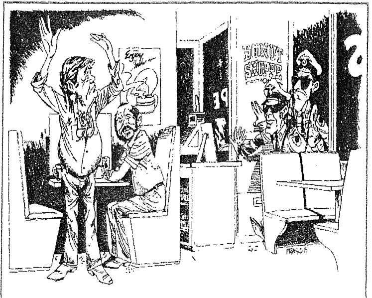
“Ease up, Boy, you’ve been sober for two years now. They’re only here for coffee and doughnuts.”

THIS IS A TREMENDOUS OPPORTUNITY FOR REALLY MEANINGFUL TWELFTH STEP WORK. PLEASE CONSIDER HOW YOU CAN MAKE A DIFFERENCE.