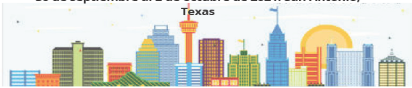
Hogar de The Alamo, S.A. Missions World Heritage Site y Riverwalk www.2021NAAAW.org

30 de septiembre al 2 de octubre de 2021. San Antonio,