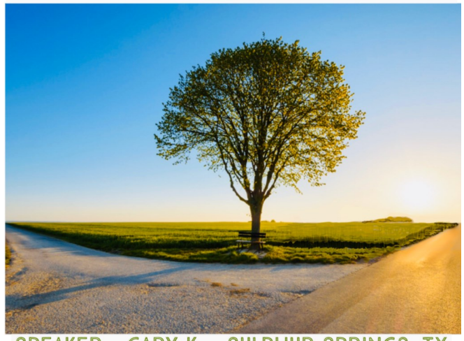
SPEAKER - GARY K. - SULPHUR SPRINGS, TX

"Nothing matters more to AA's future welfare than the manner in which we use the colossus of modern communication. Used unselfishly and well, it can produce results surpassing our present imagination."